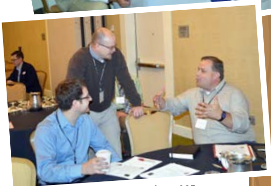
Memories of past RSTM Conferences