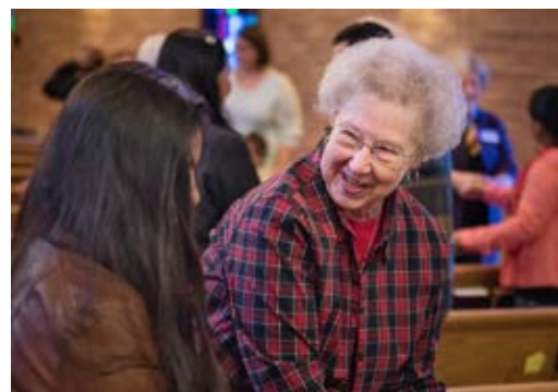
Worshippers greet each other at Salem Lutheran Church in Springdale, Ark.