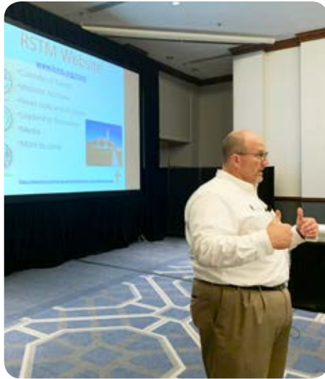
⤴ The plenary sessions were well-attended and received great feedback.