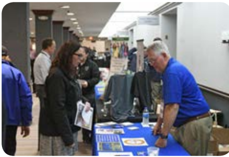
⤴ The conference was well-attended, and the food was excellent!