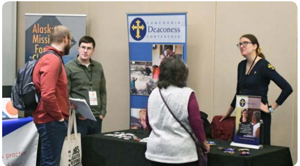
^ Exhibitor Bingo was lots of fun and offered participants opportunities to win fabulous prizes ... including a $200 gift certificate from Thrivent!