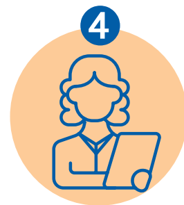
4 Lutheran school teachers