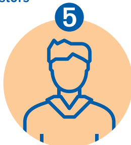
5 Youth group leaders