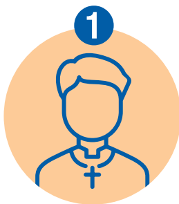
1 Personal encouragement from pastors