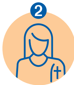
2 Commissioned church workers*