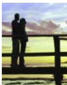
Cruise Control Page 3