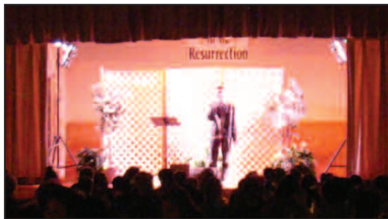
Concert at Café Ablaze

When the doors opened that night, members of the congregation and visitors from the Garden City community flowed in and filled the café to capacity, at over 180 people. Guests enjoyed listening to relaxing music, chatting with friends, and sampling the various coffee, desserts, fruit, and gelato in the friendly atmosphere.