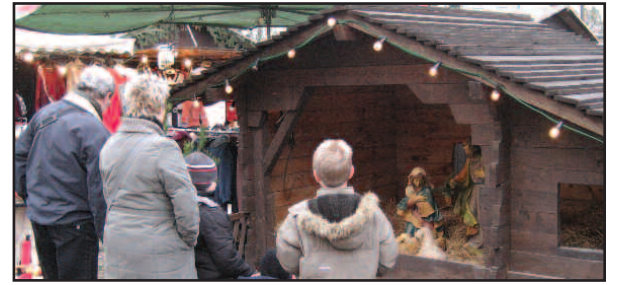
Wittenberg's Christmas market is in front of the Old City Hall and very near the town church, St. Mary's, with its iconic twin steeples.