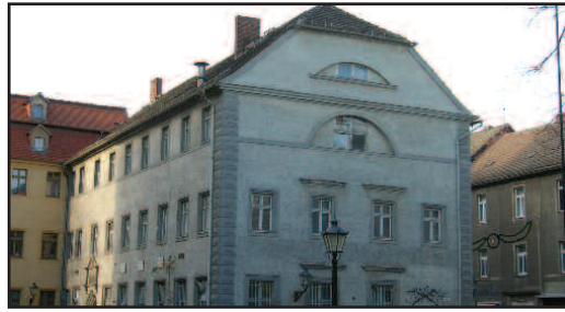
The 16th-century building owned by the International Lutheran Society of Wittenberg