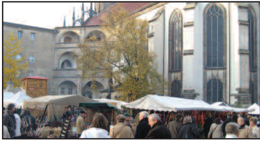
This medieval fair, held behind the Castle Church, is one of the many festivals that attracts German and international visitors to Wittenberg.