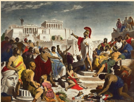
“Pericles’ Funeral Oration” by Philipp von Foltz (1805–1877)

The fifth century B.C. witnessed two remarkable moments in the history of Western education. It was then that Pericles oversaw an Athenian culture that still dazzles students to this day. In philosophy, Plato reflected on what constitutes reality and happiness. In medicine, Hippocrates advanced knowledge significantly. In architecture, Ictinus