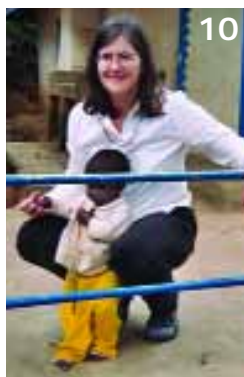
Lutherans in Medical Missions

Christian medical workers witness the love of Jesus Christ through their medical missions in order to heal bodies and point to the only true healer.