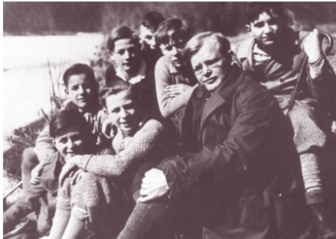
A young Rev. Dietrich Bonhoeffer is shown on an outing near Berlin with a church boy's group in this undated photo.

through this difficult period of our national history with the Christian people of Germany. Christians in Germany have the terrible alternative of either willing the defeat of their nation in order that Christian civilization may survive, or willing the victory of their nation and thereby destroying our civilization. I know which of these alternatives I must choose; but I cannot make that choice in security.”