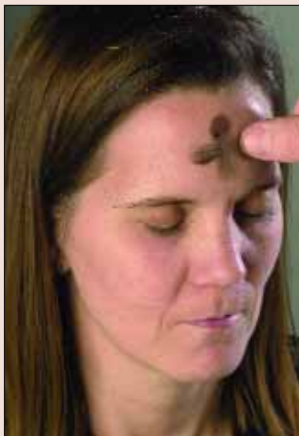
The ancient custom of being marked with ashes on Ash Wednesday is a gesture of repentance and a reminder of our need for cleansing.

The season of Lent brings us face to face with the reality of what was required of Jesus for us to receive such a wonderful blessing. I speak, of course, of His life of perfect obedience to God's Law, His terrible suffering, and His sacrificial death on Calvary for the whole world.