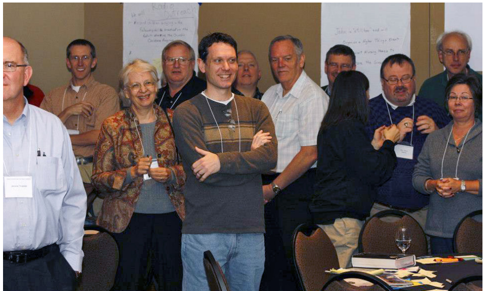
Scenes from the LCMS 2012 Rural and Small Town National Conference.