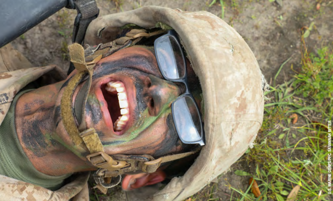
U.S. MARINE CORPS/PEC SAVANNAH BUTTER