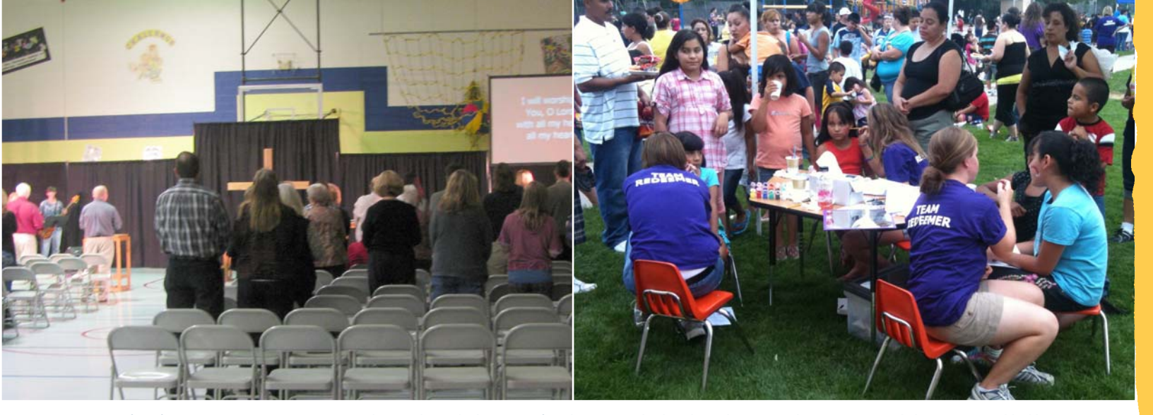
Left: Before securing a permanent site in Greeley, worship took place at Monfort Elementary School. Right: Redeemer members are intentional about serving and building relationships in their community.

and more. Through radio announcements, newspaper ads, social media and word of mouth, the Greeley site grew from an idea to a core group of worshipers.