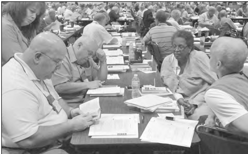
Convention delegates participate in Bible study every morning... Monday's topic for discussion was "Forgiven to forgive."