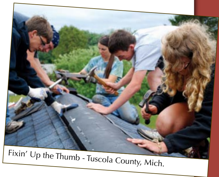
Fixin’ Up the Thumb - Tuscola County, Mich.