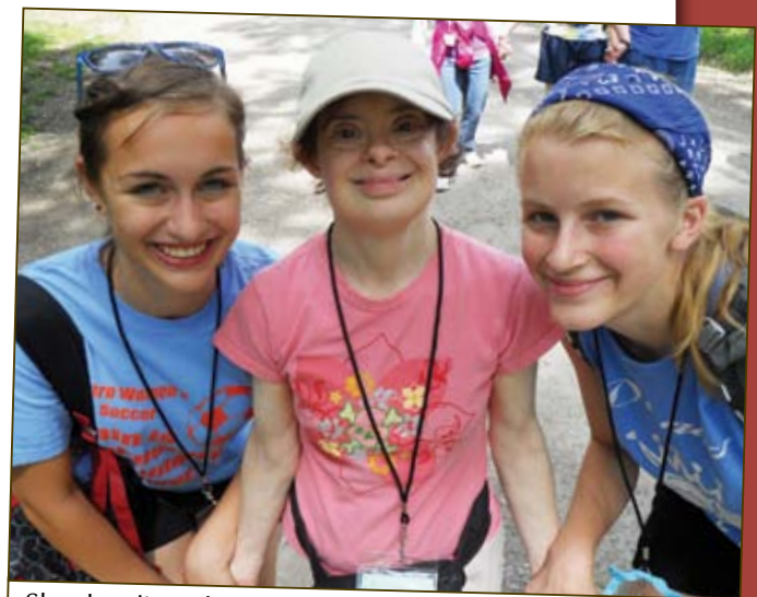
Shepherding Sheep - Camp Wartburg in Waterloo, Ill.