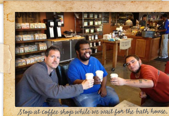
Stop at coffee shop while we wait for the bath house.