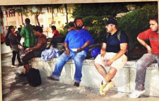
A LATE NIGHT STREET CORNER FEEDING MINISTRY.

he never took me up on my offer or those from others. He chose to remain on the streets instead. It has been a long while since I last saw him. In the time since, his hair has grayed, his lips marred from the crack pipe. This lost sheep didn't want to be found. Some sheep want to hide in the dark places, places we'd rather not go for fear muck and mire might get on us. And so we see people like him as unclean. They are our modern day lepers. But do you know what you see through Christ's eyes? That's someone's son, that's MY lost brother. That's the coin so precious that Christ would freely give all that He has to find it.