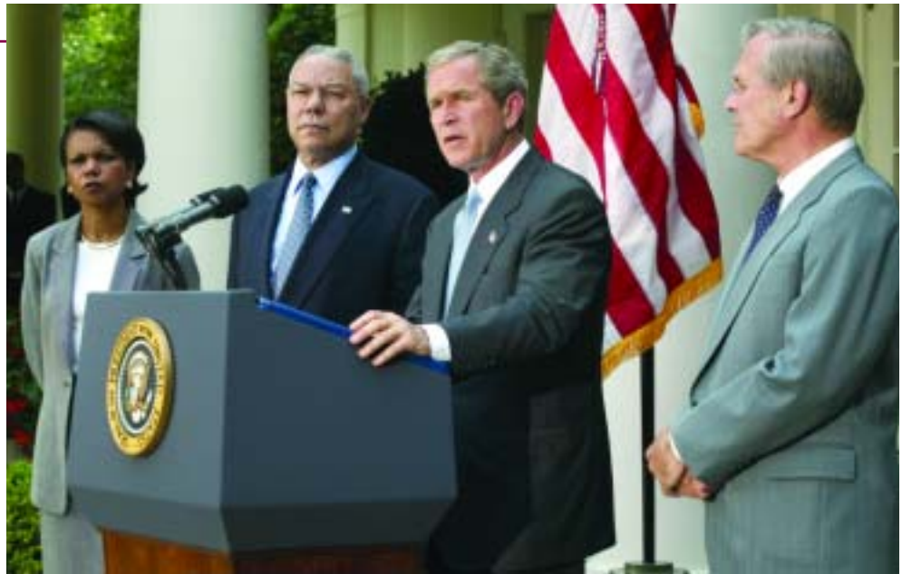
The use of military force is the prerogative of government following properly constituted procedure for declaring and waging war. Recently, U.S. President George W. Bush explained his plan for the Middle East as National Security Advisor Condoleezza Rice, Secretary of State Colin Powell and Secretary of Defense Donald Rumsfeld listened.

As Lutheran Christians, we should remember that we are called to responsible service "in" the