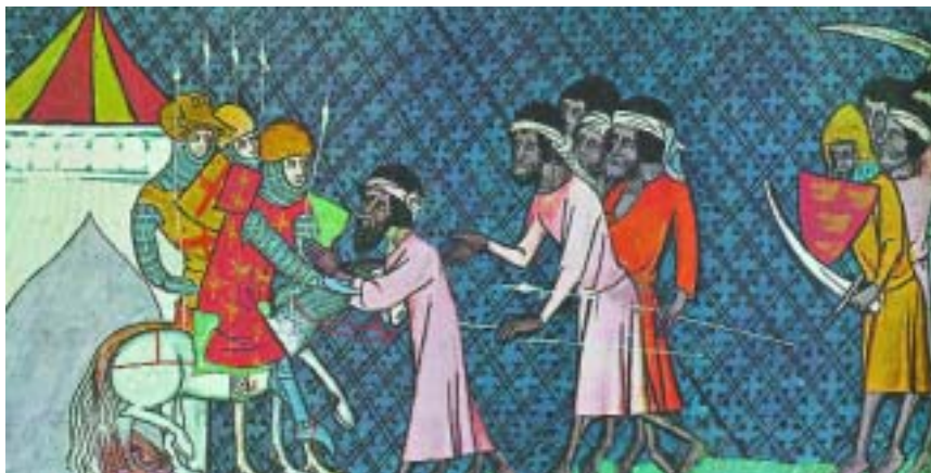
Over the past two millennia, Christians have reacted to international threats with every approach from the “holy wars” of the crusades to absolute pacifism.

While the Lutheran confessional writings do not treat the subject of war at length, they do contain significant references to it (for example, in Luther’s commentary on the Lord’s Prayer in the Large Catechism , in Article 21 of the Augsburg Confession , and in Article 4 of The Apology of the Augsburg Confession ).