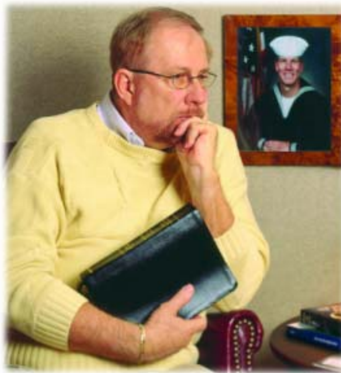
As menacing international developments cause anxiety, Christians need to prayerfully consider when engagement in warfare may be morally acceptable, and when it may not.

Formal declaration. Since the use of military force is the prerogative of government and not of private individuals, properly constituted procedure for declaring and waging war must be followed. As Thomas Aquinas commented, “it is not the business of a private individual to declare war ... as the care of the common weal is committed to those who are in authority.”