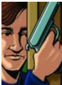
As We Forgive Those Page 3