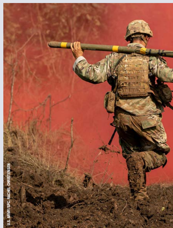
U.S. ARMY/SPC. RACHEL CHRISTENSEN