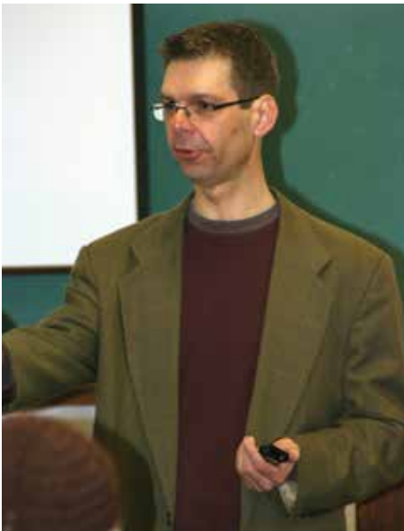
Concordia Seminary, St. Louis

“Ultimately, when your pastor is excited and learning Scripture, the congregation will catch that and want to