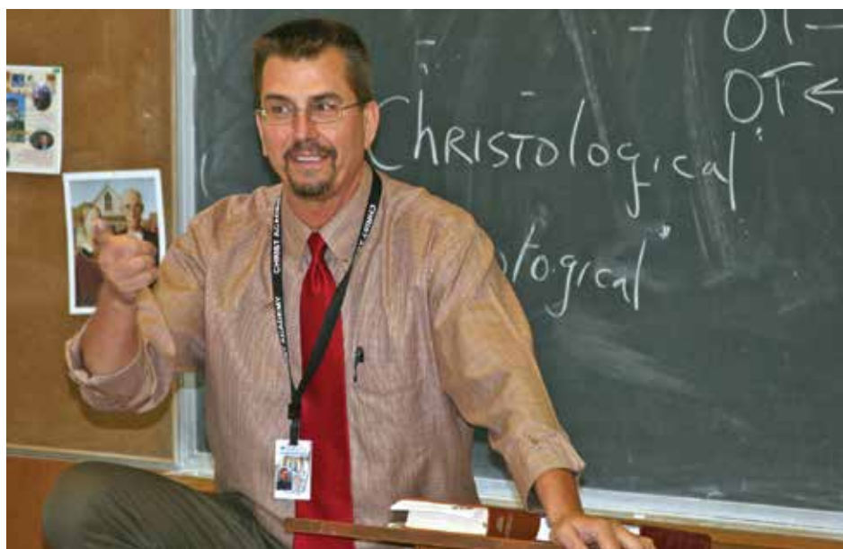
Concordia Theological Seminary, Fort Wayne

Each summer, continuing-education courses are available at different locations around the country, depending on where it is most viable and convenient