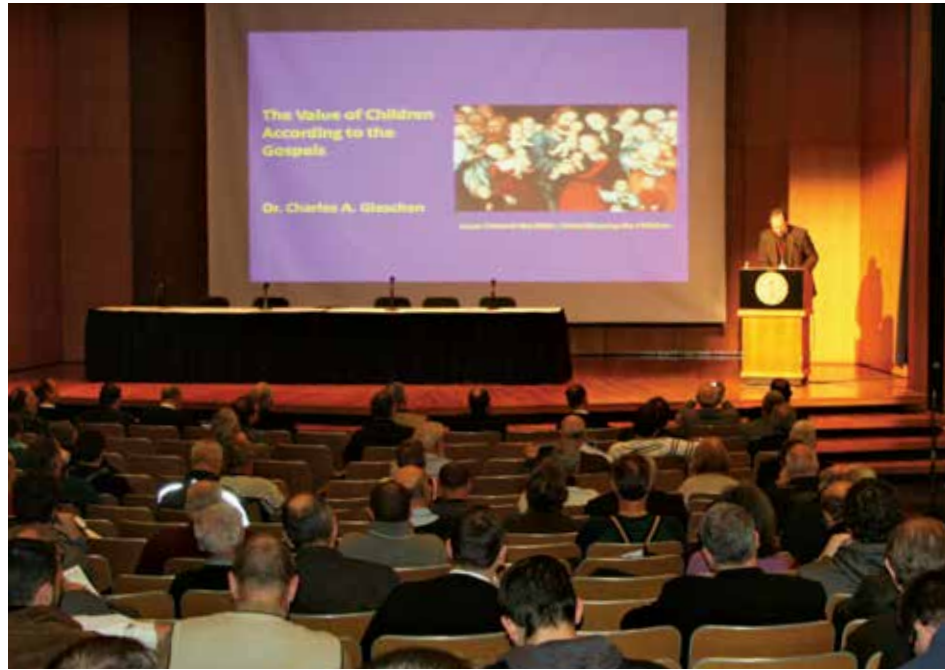
Concordia Theological Seminary, Fort Wayne